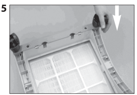
Press on caster until it snaps into place. Repeat steps 4 and 5 with the remaining casters.