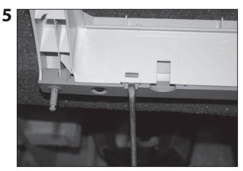
Using a flat-head screwdriver, press firmly into the slotted tab.