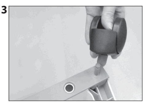
Remove each caster from the rail by pulling it straight off. The caster pins will be exposed.