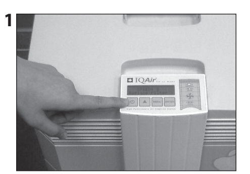
Switch the device off.