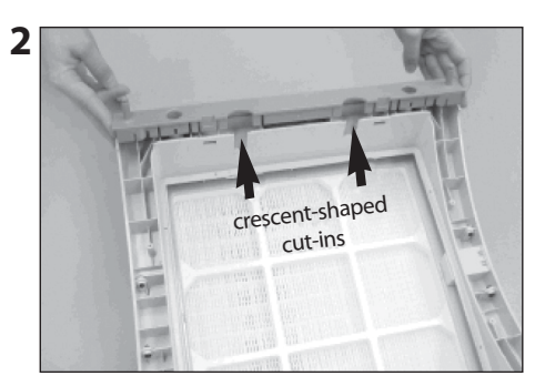
Place the mounting rail on the purifier's base so that the holes line up with the black connector pins on the base. The cut-ins should face the center of the unit.