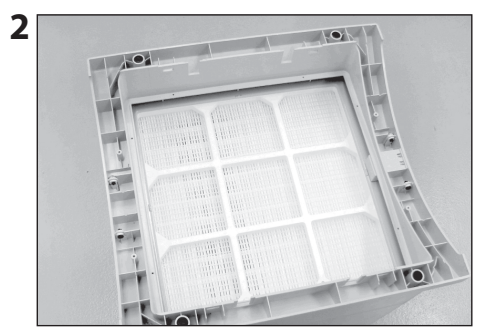
Turn the device upside down on a soft and clean area or surface.