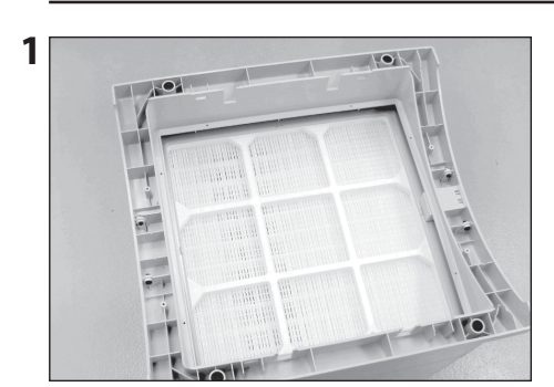
Turn the device upside down on a soft and clean area or surface.

For installation simply follow the instructions below: