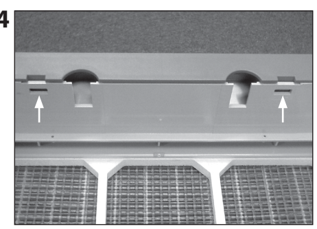
There are two slotted tabs on each rail.