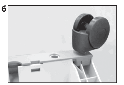
Ensure that each caster is securely fitted before placing the air purifier in its upright position onto the casters.