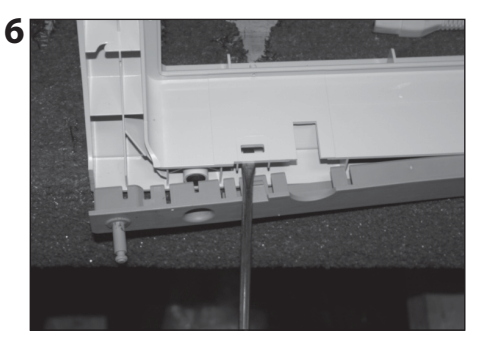
Use the screwdriver to gently loosen and lift the rail away from the base. Lift the rail out by hand. Repeat steps 5 and 6 for the second rail.

Refer to the instructions Fitting Your Air Purifier with Casters, located on the back of this form to install casters onto the air purifier.